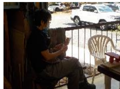
Tinyu striving for perfection.