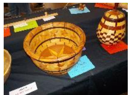
Another deserving winner.