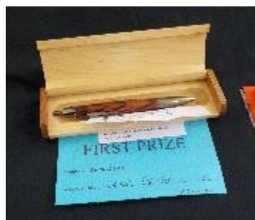
A magnificent pen.