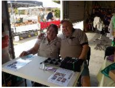
The Walkers awww.