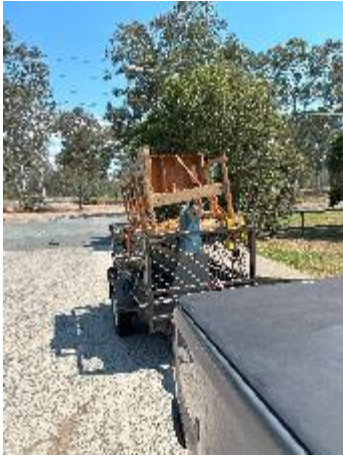
On the road home.