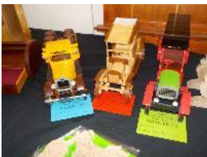
Toys are great.