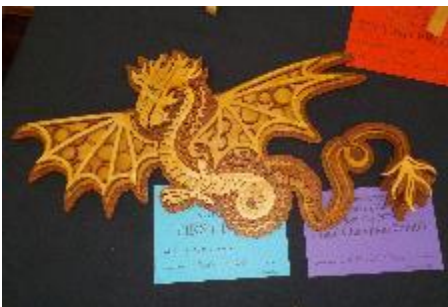
The winning Dragon.