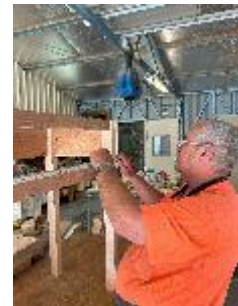
A rare instance of Ross using a ruler.