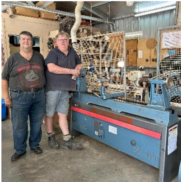
All set up and ready to go with two happy woodturners.