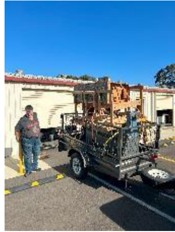
Safe arrival at the Guild